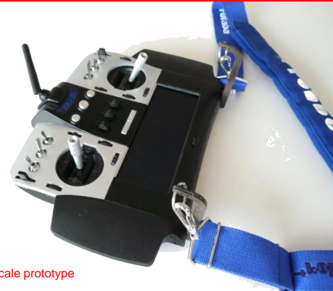
1:1 Scale prototype

Project schedule for ROBBE GmbH, Germany Development of a remote control